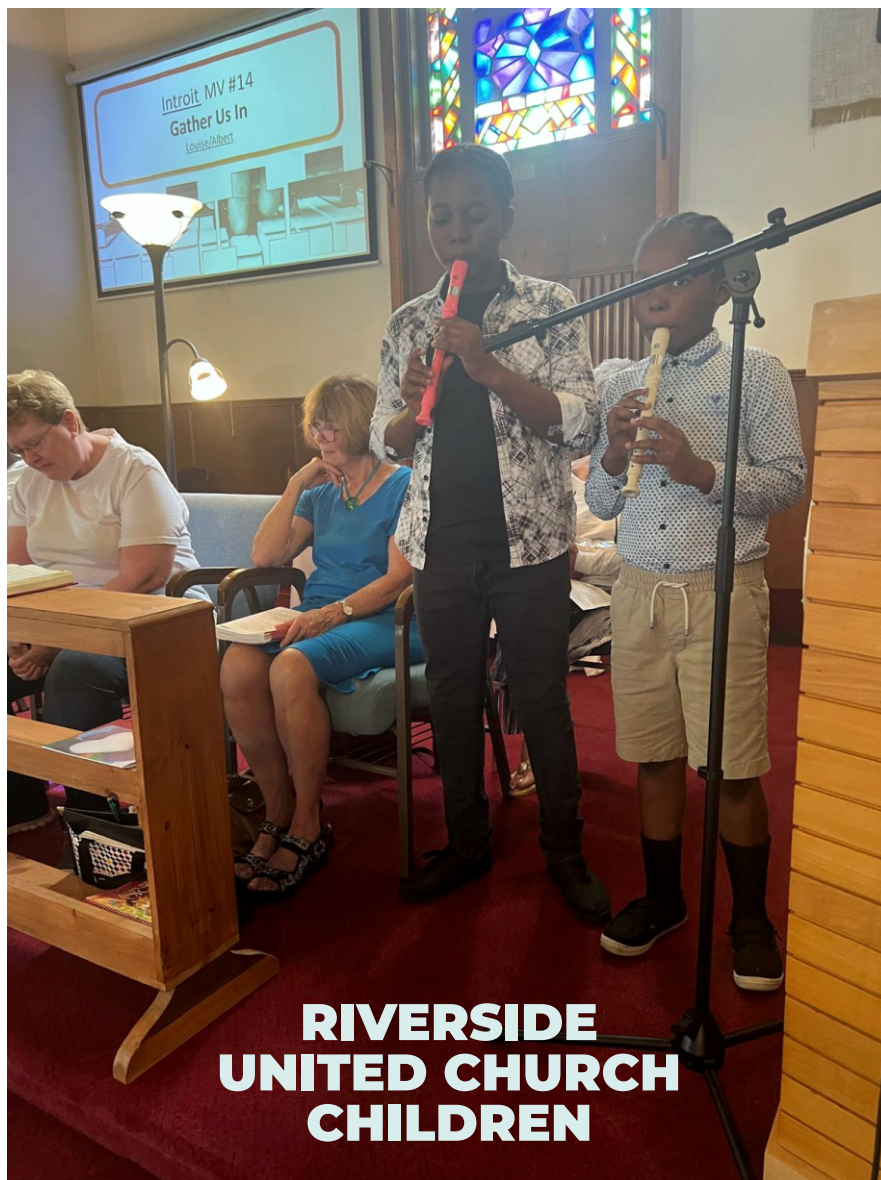
RIVERSIDE UNITED CHURCH CHILDREN

We continue to experience growth in Riverside United Church children ministry. The children are superb joy to the community and we cherished their dedication and support in our worship service. May God continue to bless all the children and their parents. Amen.