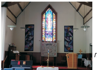
'May God bless you and keep you; may God's face shine on you and be gracious to you; may God's face turn toward you and give you peace.'

Address: 200 Chemin de la Grande-Côte, Rosemère, J7A 1H4